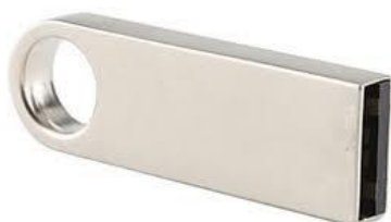
Item 11- Metallic USB Memory Stick