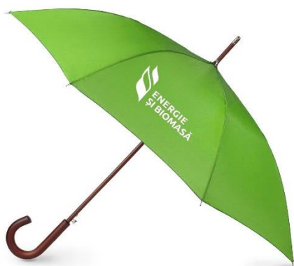
Item 7 - Rain Umbrella