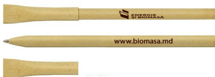
Item 9 - Pens