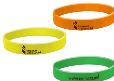
Item 10 - Rubber wrist band