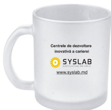
Item 13- Mugs