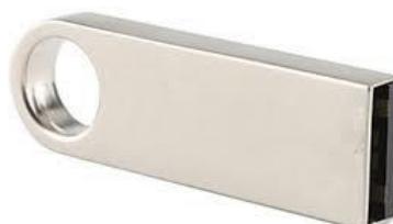
Item 12 Metallic USB Memory Stick