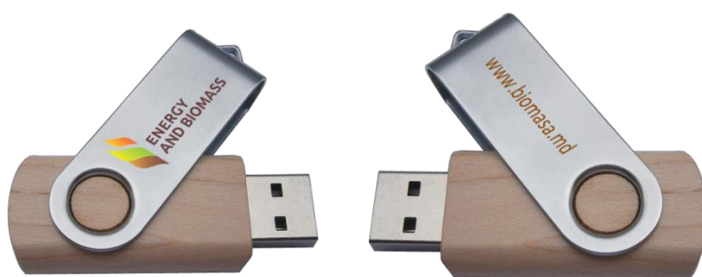
Item 8 - Wooden USB Memory Stick